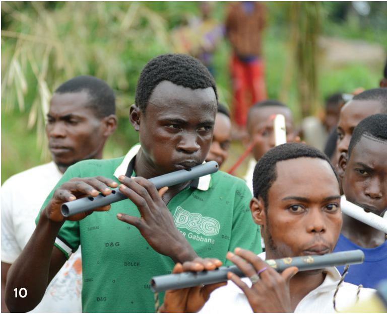
10. A spontaneous celebration broke out in the community after the conclusion of the formal part of the program.