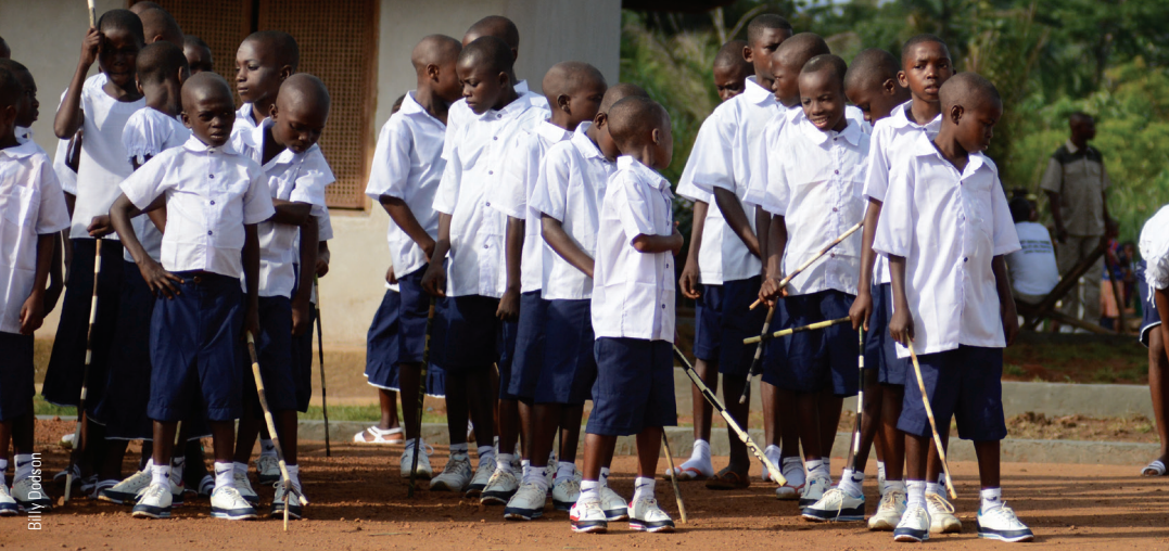
Students at AWF's Ilima Conservation Primary School await the start of the school's inaugural celebration. The new school stands in the background.

Your support at work in Africa's landscapes